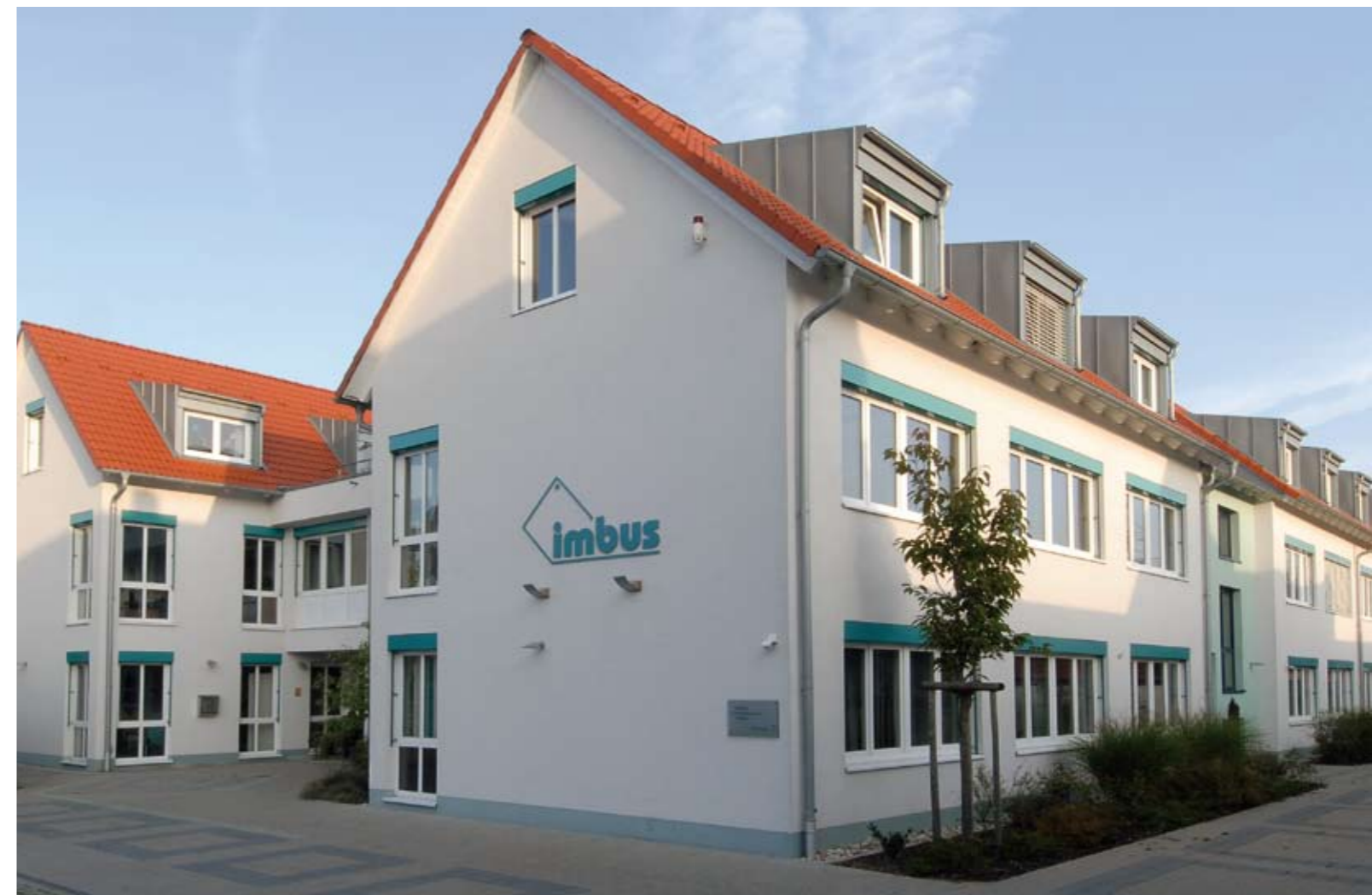
imbus AG headquarters: The head office near Erlangen, Germany

Our mission: top quality, better performance and convincing test technology from a single source.